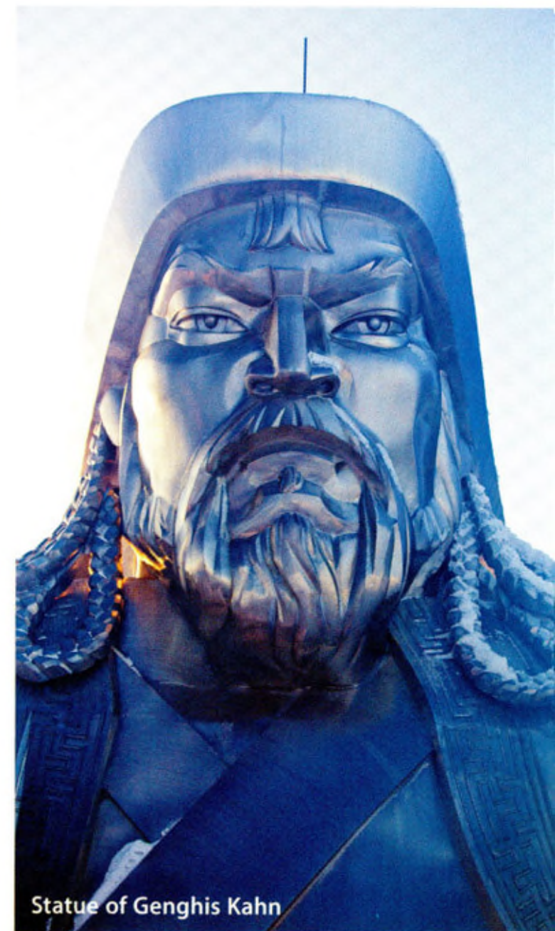
Statue of Genghis Kahn